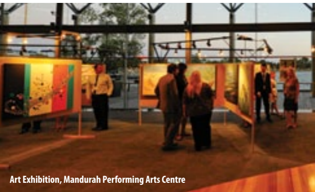
Art Exhibition, Mandurah Performing Arts Centre