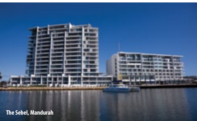
The Sebel, Mandurah