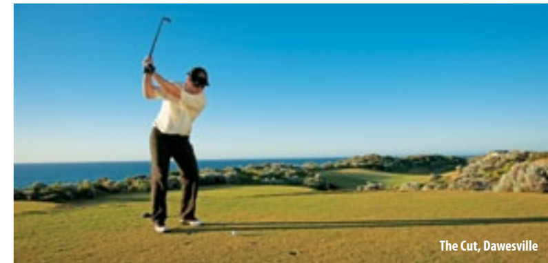
The Cut, Dawesville