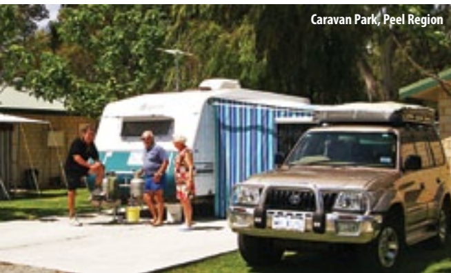
Caravan Park, Peel Region