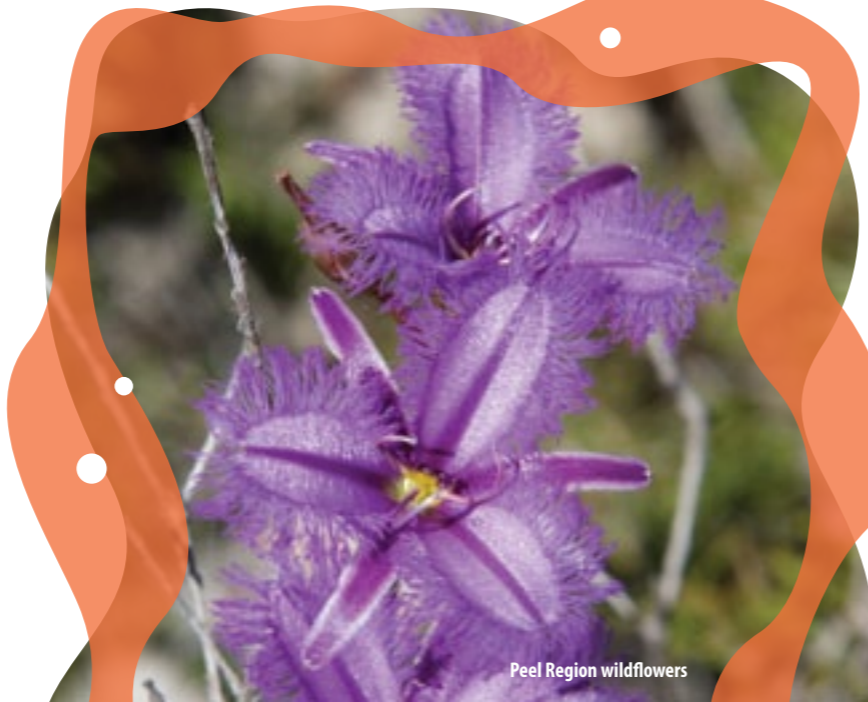
Peel Region wildflowers

Retrace your steps over the bridge and turn left into Mandurah Terrace. Wander towards the Old Brighton Hotel (1894) and finish off the day with a refreshing, local ale overlooking the lights of the eastern foreshore.