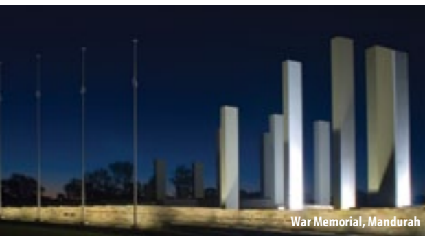
War Memorial, Mandurah