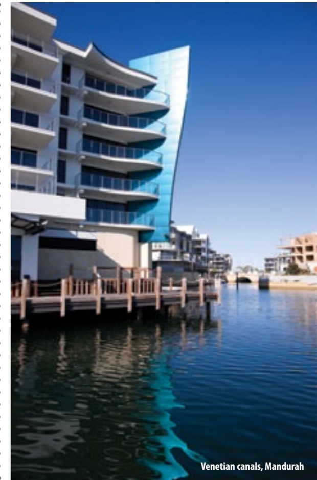
Venetian canals, Mandurah