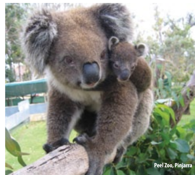
Peel Zoo, Pinjarra

It's worth checking what big productions might be playing at the glorious Mandurah Performing Arts Centre overlooking Mandjar Bay. And of course there's always something fun playing at the cinema complex right next door.