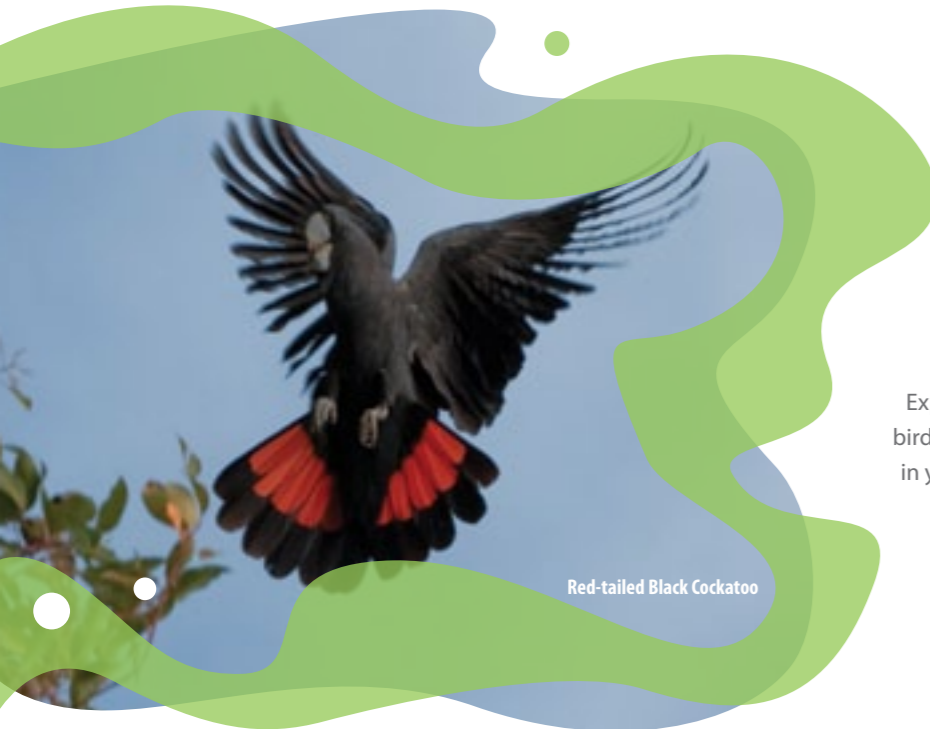
Red-tailed Black Cockatoo

The diversity of this region means there's always something different to discover.